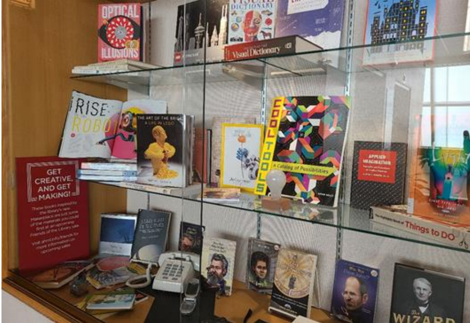
One of the Friends of the Library display cases featuring making.